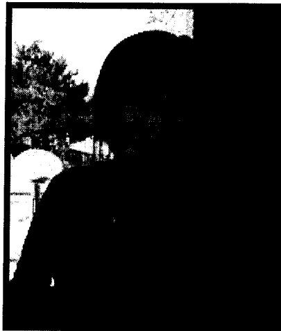
Bhutanese Refugee, Student, Volunteer, Employee, Interpreter